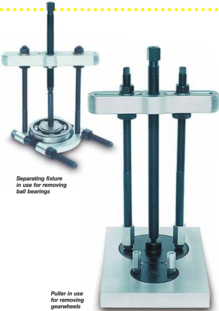
Separating fixture in use for removing ball bearings