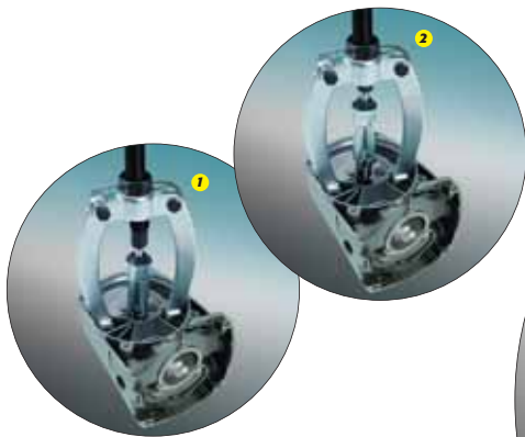
After attaching and locking the puller No. 11060/11061 1, the central threaded spindle 2 is turned to ease the bearing off its mount without causing damage.

A three-armed puller is generally preferable to a two-armed one provided there is sufficient space because it distributes the pulling forces more evenly.