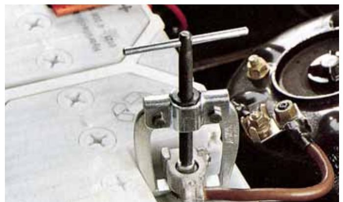
Battery terminal puller in use on a car battery